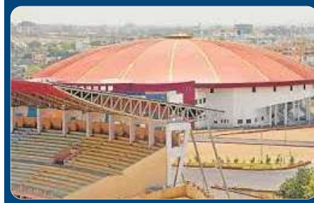
Divisional Sports Complex