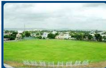
ADCA, Cricket Ground, N-2, CIDCO