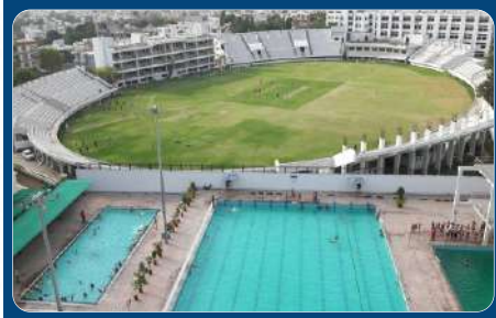
MGM Sport Complex