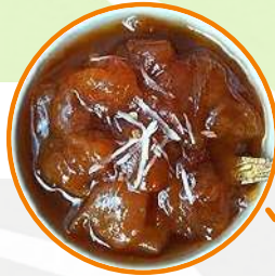
Qubani ka Meetha