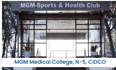
MGM Medical College, N-5, CIDCO