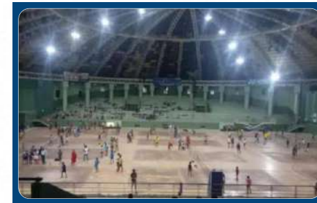
12 Courts Badminton Hall, DSC