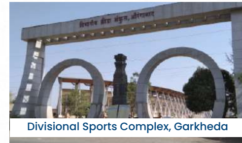
Divisional Sports Complex, Garkheda