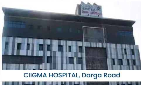
CIIGMA HOSPITAL, Darga Road