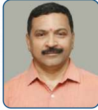
Shree. Deelip Swami

Mch. Pead. Surgeons Ex. Minister of state for Finance of India, Member of Parliament