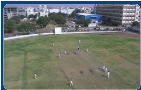
MIT Sport Ground