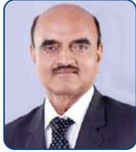
Dr. Bhagwatji Karad

Mch. Pead. Surgeons Ex. Minister of state for Finance of India, Member of Parliament