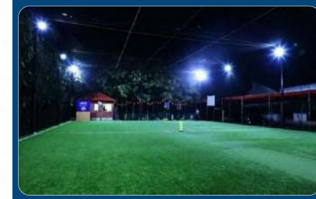
Backwood Arena Turf