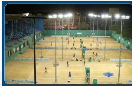
Tennis Court Endurance Gym