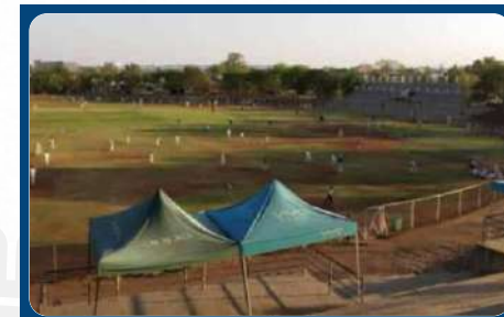
Garware Stadium, Chikhalthana